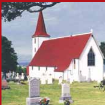
St. John the Evangelist Church, Topsail, Conception Bay South