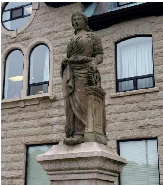
"The Maid of Industry"