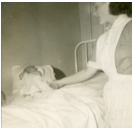
Maternity ward. Date unknown.