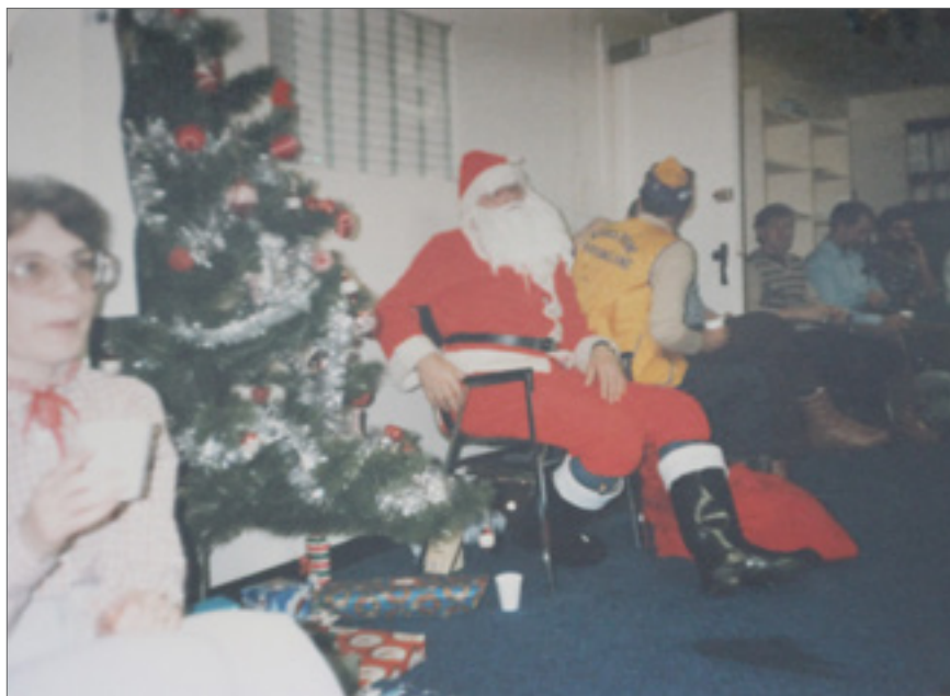
Christmas party.