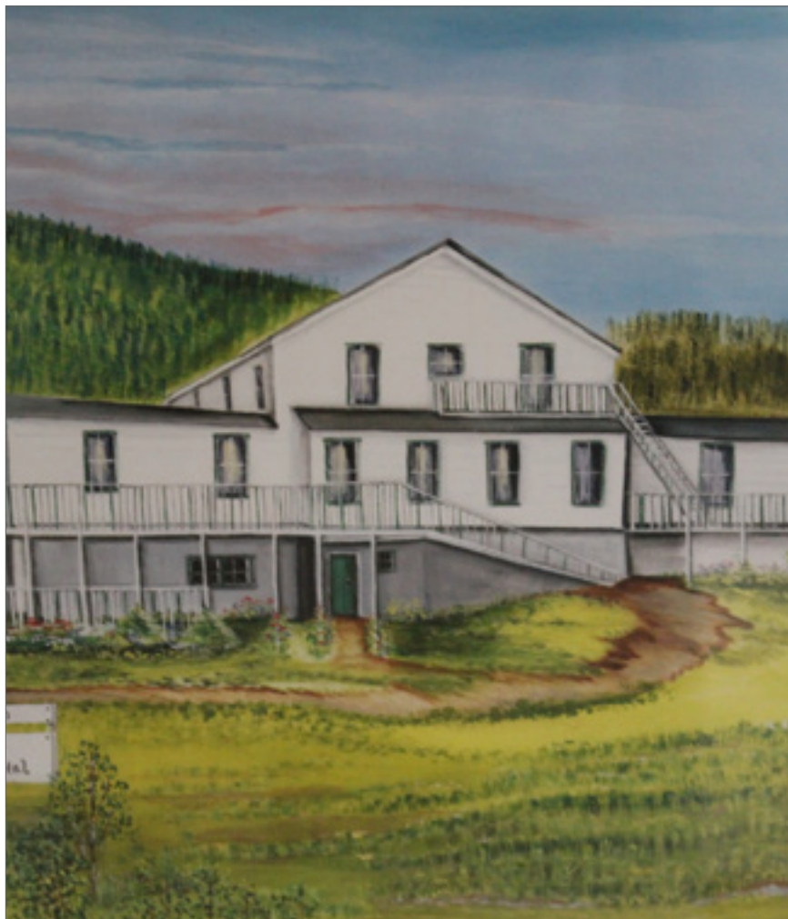
Bonne Bay Cottage Hospital depicted in painting by local artist, Derek Caines.