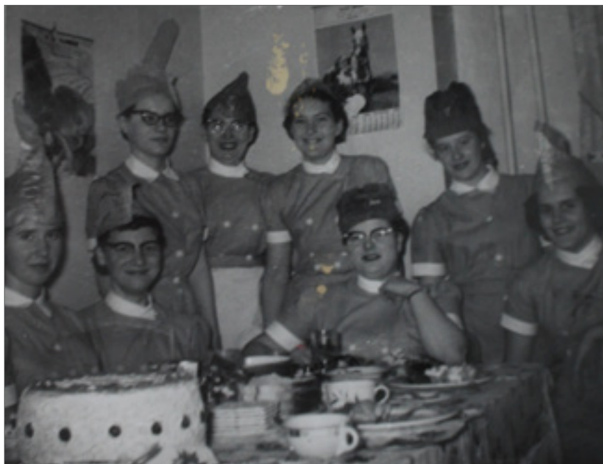
Celebrating a staff birthday.