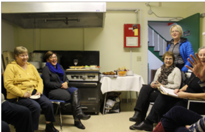
Memory Mug Up at the Cottage Hospital. 2018.