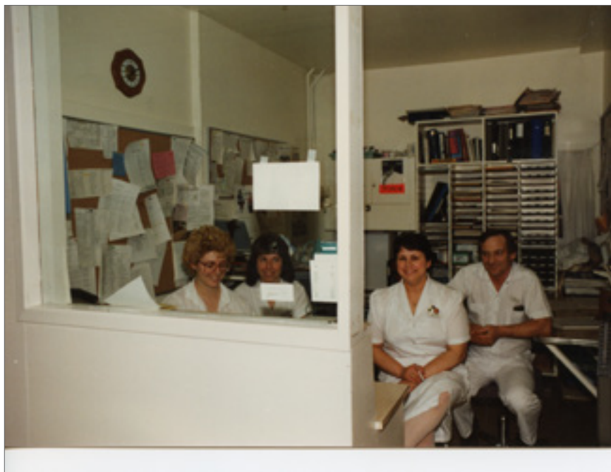
Nursing station.