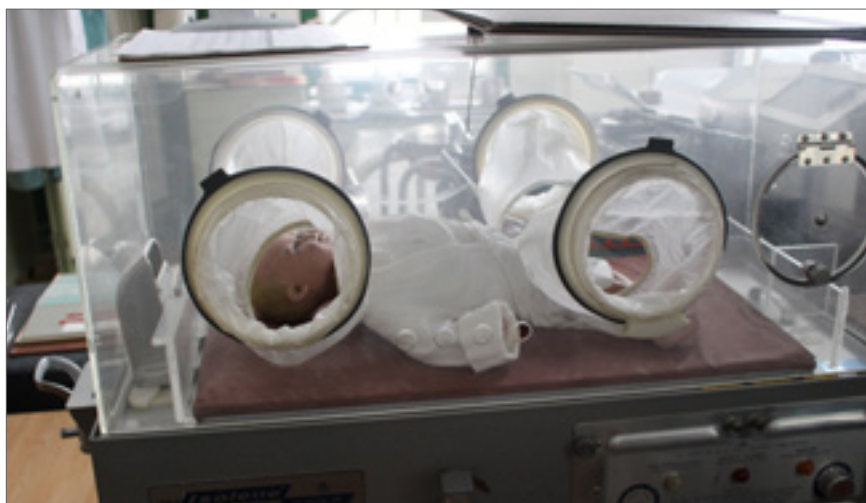
Old incubator. 2018.