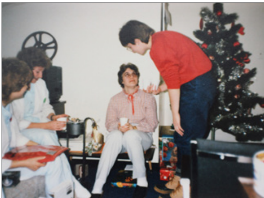
Staff Christmas party.