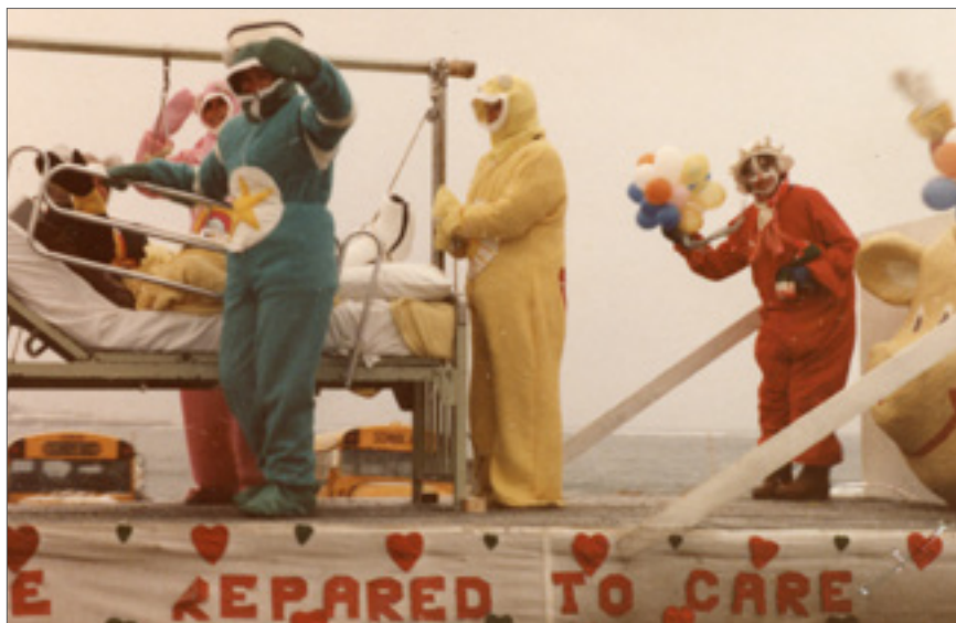
Christmas parade.