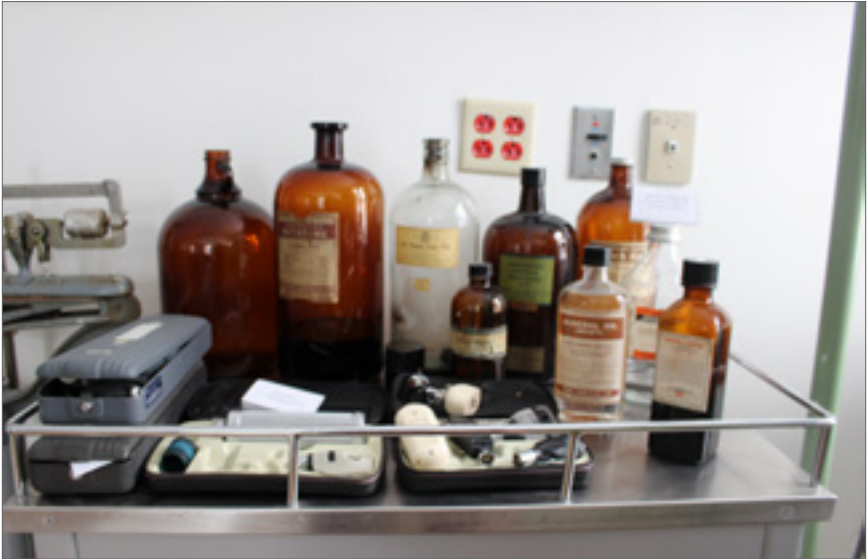
Old medicine bottles in the museum. 2018.

The use of folk medicine still goes on. There's really a parallel system of care everywhere in the world. There's what people do at home to help themselves and what the doctor suggests. Sometimes you come in and get the doctor's opinion or the nurse practitioner or physio, but you kind of incorporate your own belief system and your own home remedies and advice. I don't think that's actually changed that much. You still hear about people using poultices for abscesses and a variety of things like that. We never really used folk medicine in the hospital. The odd physician might have their own cocktail for a certain situation, you know, constipation or the example of an abscess. It wasn't anything wild and crazy. — Dr. Jim Bowen