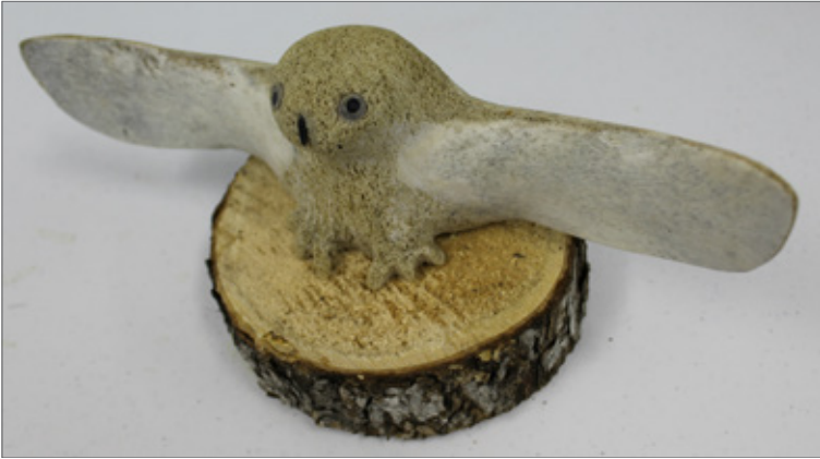
Whale bone owl made in Pond Inlet. 2018.