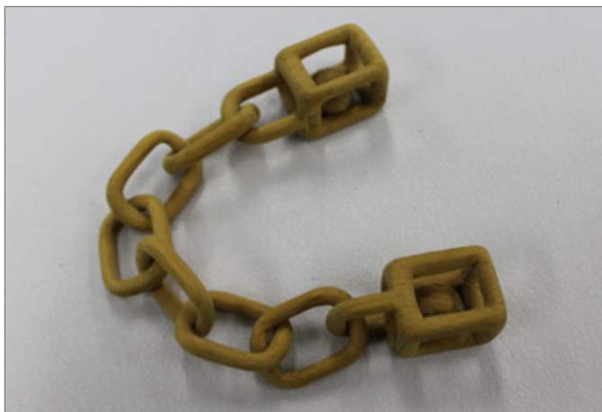
Wooden links carved by Josh Burdett from a single piece of wood. 2018.