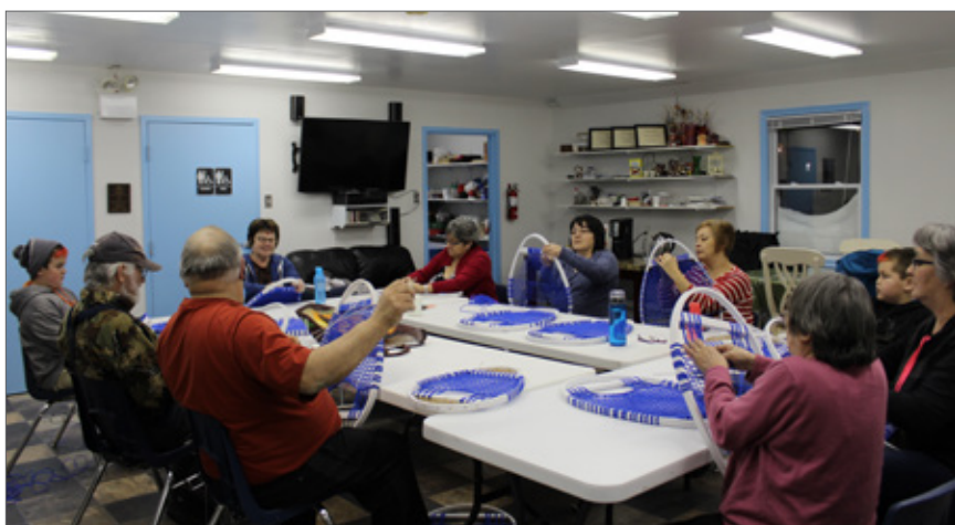
Participants at snowshoe making workshop held at the 50+ club community centre. 2018.

“The traditional snowshoes from around here come off the Innu pattern for the most part and they used to make them for conditions. They would have snowshoes made for light snow walking, for heavy snowfalls in the wintertime they would be a big bow, a massive size bow. Then they would come down from that for better conditions. They probably had about three pairs of snowshoes in their stock [for] anybody who travelled a lot by foot. And 90% of the people around here did all their travelling by foot - very seldom used dogs - until skidoos came of course. So you couldn't expect to move around with a small pair of snowshoes after a big winter snowstorm so a lot of those guys would go in the country with two pairs on them. A smaller pair in case the weather turned mild and the conditions got better and a big pair to muck through the fluff,” explained Woody Lethbridge.