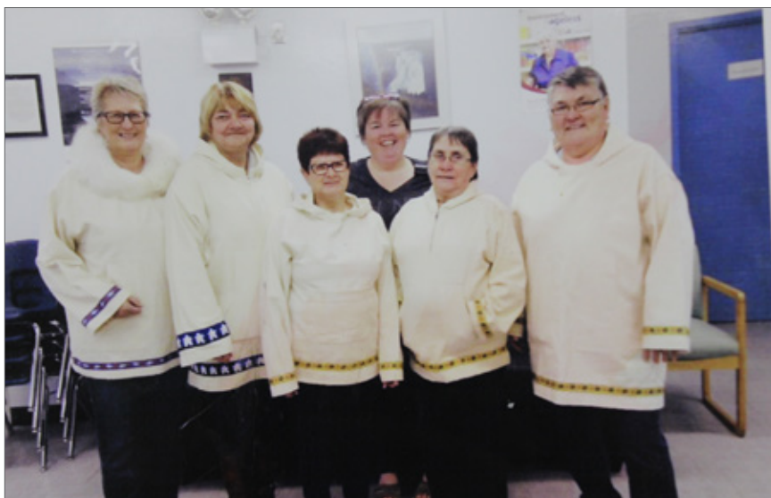
Photo hung in the 50+ club community centre of the dickie making course that was offered in the centre.

Everyone thoroughly enjoys the courses offered and we see people coming out and getting involved who never did before. We believe that the social aspect is just as important as the actual craft or function that we are able to offer.