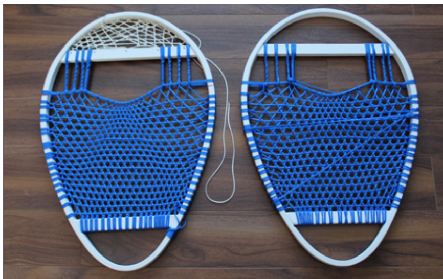
Bearpaw snowshoes made by Woody Lethbridge as part of the snowshoe making course offered in Cartwright. Photo by Terra Barrett. 2018.

“I make my own komatiks, and I make komatiks for sale too but not this year I haven’t been up to it. Usually I have anywhere from two to four or five komatiks fully finished and ready to use. The Northern people like my work, so I usually take one or two extra ones with me when I go north. Put one in the other or one on top of the other or tow two, or tow three sometimes. As I am going along I will fill the orders I’ve got. My dad used to do that even in the dog team days. That was back in the days when komatiks didn’t use nails, everything was done with wooden pegs and line. The boards were laced to the sides, to the runners, and he used to make up four or five of them and pile them on top of each other