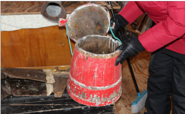
Left to right: sealskin boots, wooden tool for removing boots, and red grub bucket on top of komatik box. 2018.