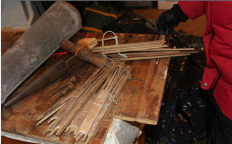
Left to right: spy bucket, tool for making a spile hole, and needles for knitting nets. Photo by Terra Barrett. 2018.