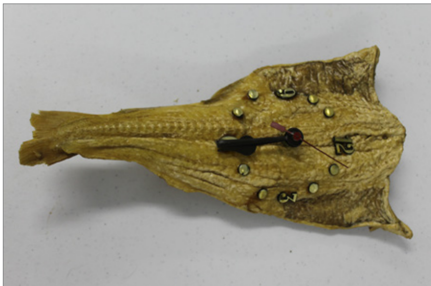
Salt fish clock made in Norman Bay. 2018.