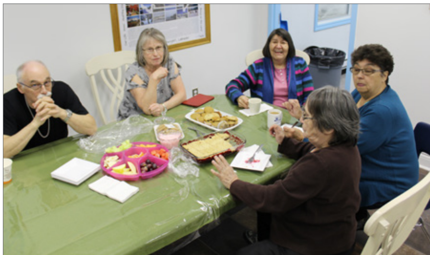
Participants enjoying a mug up at the weekly craft night in the 50+ club community centre. 2018.