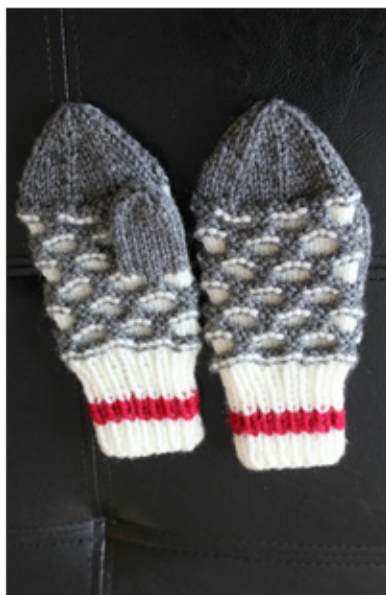
Stained glass pattern knit mittens by Doreen Clarke. 2018.