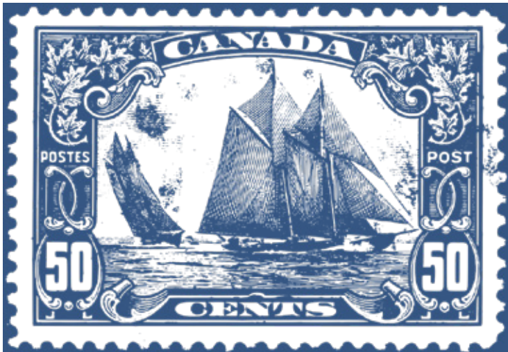
Bluenose Schooner Stamp.