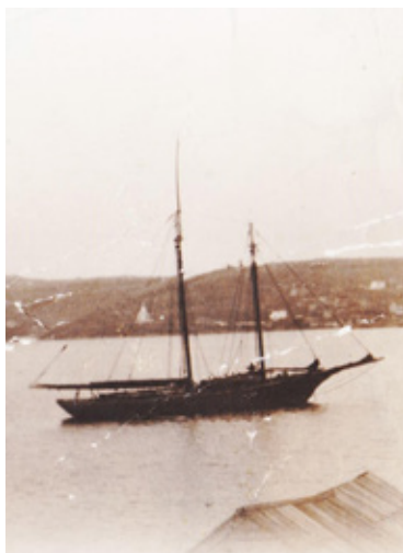
Schooner coming into Champney's