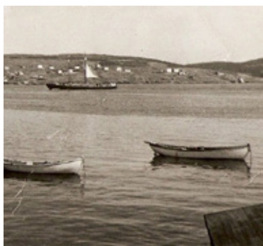
View of Champney’s West from the Champney’s West Heritage Group Incorporated.

Rushing to beat the weather, the skipper of Hazel Pearl had the ship at “full sail” as he rounded into Champney’s. Though he encountered some slob ice near the harbour entrance, he continued on and was surprised when the ice conditions suddenly changed. Clayton Moody continues: