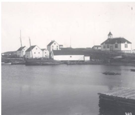
View of Catalina, ca. 1900, from the Geography Collection - Historical Photographs of Newfoundland and Labrador, Digital Archives Initiative, Memorial University.