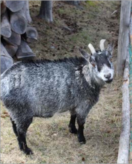
Bella the goat.

When my children were small, there was a fellow in New Perlican who had a goat whose mother had died, I believe, and he had to wean it on a bottle, you know. We took it in here and we made a pet out of it. That goat would play like a dog, with the children. There was a pile of rocks out here in front of the house where they dug up for water and sewer. Big boulders right, they're gone now. The kids and the goat would play jump the rocks,