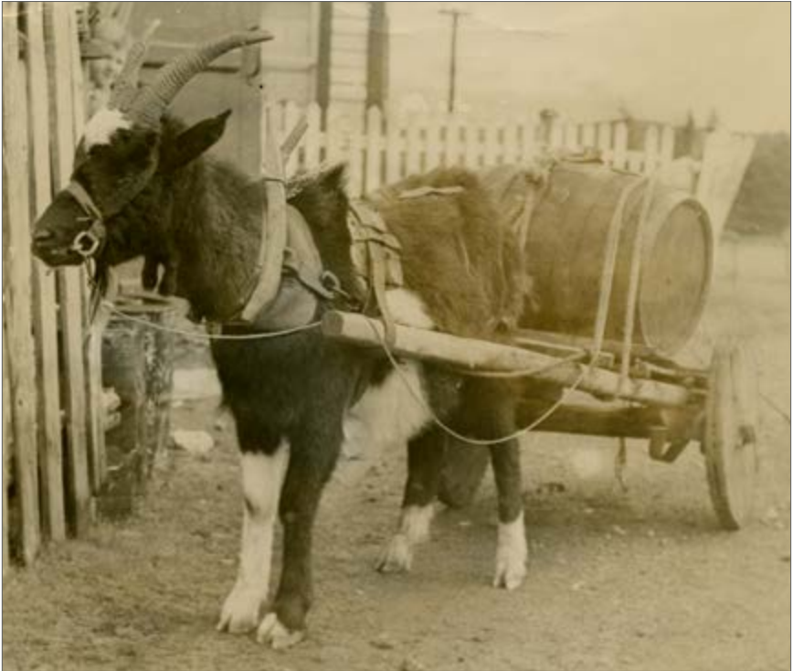
Unidentified goat with water barrel.

“You can go on, now.” He said, “I’ll dodge on behind you.” So my husband got on the slide, with the hoops and came on, came down over the hill so fast he passed along by the merchant’s store. He never stopped ‘cause the goats wouldn’t stop, and they passed along by the merchant’s store. And his grandfather got there and he wasn’t there. And he said to, there was a couple of men there, “Did you see a young feller here with the goats and hoops?” And the men said, “B’y he might be in Hant’s Harbour now.”