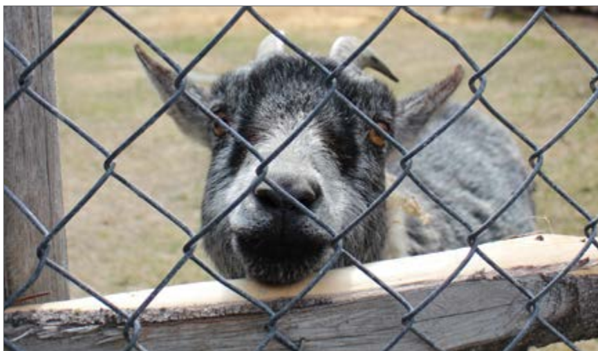
Bella the goat.

which is easy, and tackle the goat on and go home. Usually it was downhill so you had to be careful that you kept the wood behind the goat because the goat was good on level or on up hill. One winter I, being creative, decided I would take the goat around the pond going in because goats were not very good on ice. They're not like horses which are shod. I took the goat up around the pond on the path staying clear of the ice, loaded up the slide with wood and decided instead of going down around the pond again going home, I would put the goat on the slide on the wood and slide it across the pond. It didn't work. Instead of me dragging the goat on the slide the goat on the wood just didn't work. I had it on top of the wood first. I thought I trained it to stay there but it didn't and I ended up dragging the goat and the wood across the pond. I'll never forget that experience. –Phil Warren