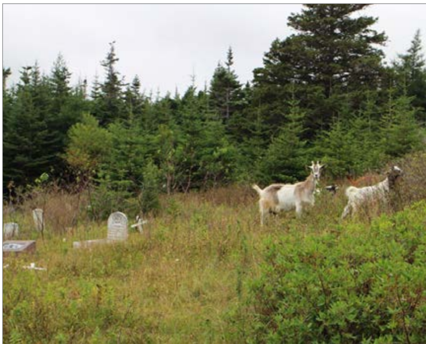
Goats in St. Augustine Anglican Cemetery. 2016.