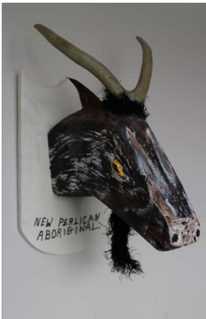
Folk art goat by George Burrage