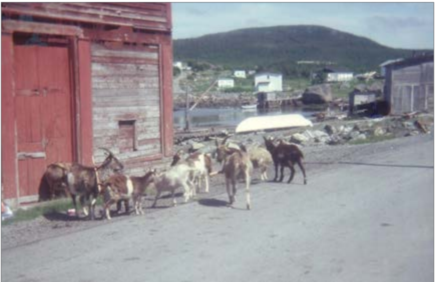
Goats in front of the old post office on Harbour Road, early 1960s.

Now our goat Nancy was a kind of a pet thing, you know. I know she annoyed a lot of people around, because she would get in, like on one person here, had a pair of pantyhose or something on the clothesline. Nancy goes in and she get it and she starts chewing, chewing, chewing, and sort of spoil the pantyhose. She'd go out around the store, Green's store, used to be out around the foot of the lane there. She would go out around the store and the kids would be going in buying chips and cheesies, and whatever. They would have to give her some, and if they didn't she would go along and nudge them and nudge them until they gave her some. And there were dogs on the loose as well, but the dogs only run