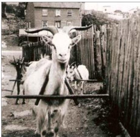
Goats wearing yokes on Pinsent's Lane, 1940s.