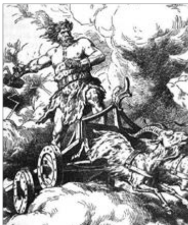
"Thor" (1901) by Johannes Gehrts