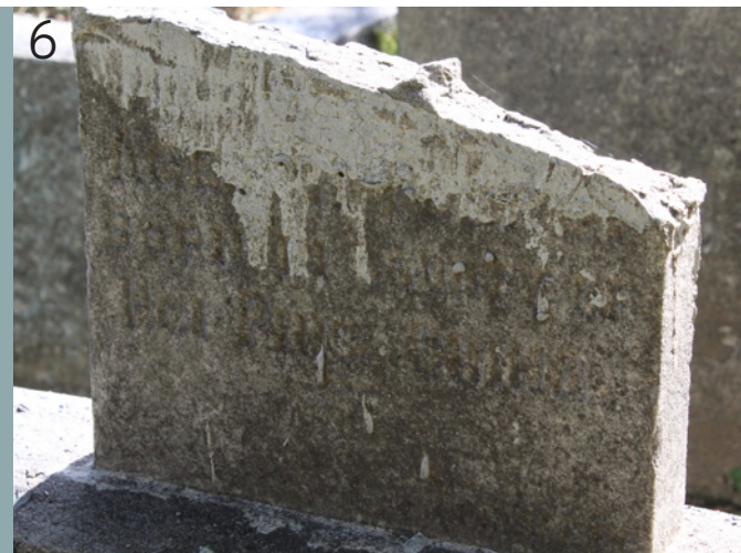
Fig 1 Celeste Billing-Meyer and Dale Jarvis measure the location of the Chinese graves in the General Protestant Cemetery while Michael Philpott draws the map (photo by Terra Barrett, 2016). • Fig 2 Terra Barrett demonstrating how to rub gravestones with charcoal (photo by Michael Philpott, 2016). • Fig 3 Plan of Chinese Graves, General Protestant Cemetery, St. John's, NL (Map by Michael Philpott, 2016). • Fig 4 Memorial marker erected by the Chinese community in memory of all those friends and relatives who have come before, 1988 (photo by Terra Barrett, 2016). • Fig 5 Open book headstone or marker 6 (photo by Terra Barrett, 2016). • Fig 6 Signs of fixative found on marker 13 (photo by Terra Barrett, 2016). • Fig 7 Cracked fragments of Chinese graves (photo by Terra Barrett, 2016). • Fig 8 Marker 26 the oldest grave in the Chinese section (photo by Terra Barrett, 2016). • Fig 9 Hong King's headstone, marker 11. VA 15b-55.5 (Photographs by Marshall Studio, Newfoundland Tourist Development Board photograph collection, The Rooms Archives). • Fig 10 Markers 1 through 5. Marker 1 is the grave of Jack Chong. Name noted as Jack Chinese on his burial record. VA 15b-55.6. (Photographs by Marshall Studio, Newfoundland Tourist Development Board photograph collection, The Rooms Archives).