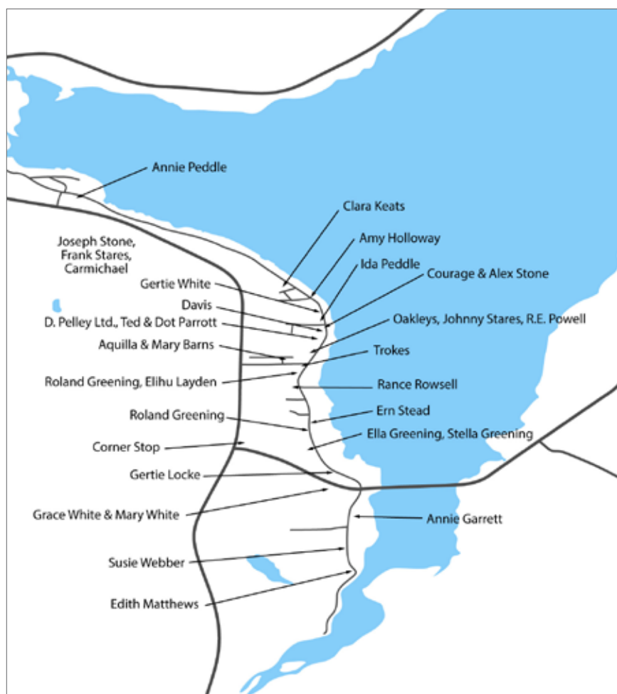
Information collected by the Port Blandford Heritage Society. Map layout by Michael Philpott. 2017.