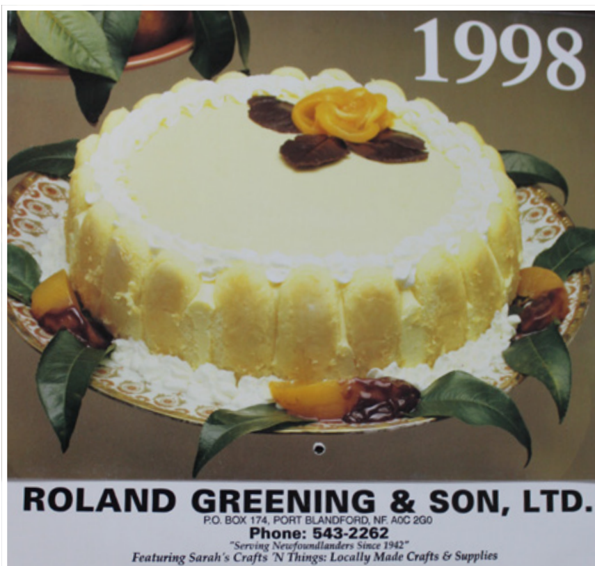
1998 calendar from Roland Greening and Son Ltd.