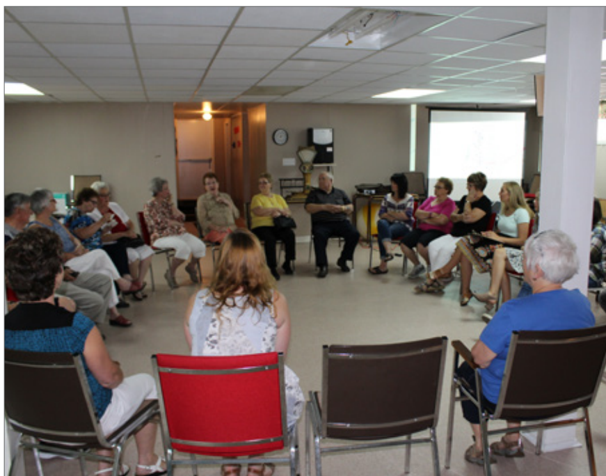
Port Blandford community mug up. 2017.

and stores were a vital part of small communities in rural Newfoundland in the past. They served as a social space where people would meet to chat and gossip. They were often at the heart of communities. This booklet encompasses some of those positive memories of years gone by, and demonstrates the importance of local shops throughout time.