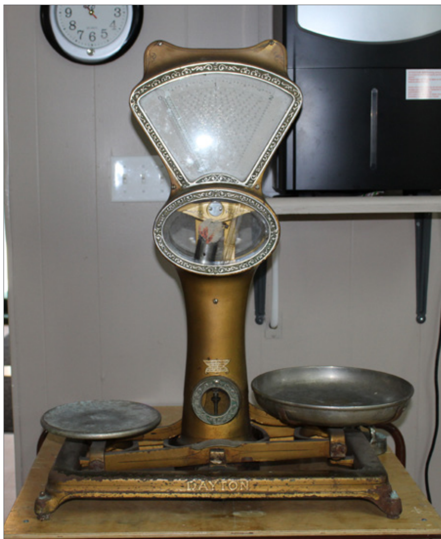
Weight Scales that were used at D. Pelley's. Photo by Katherine Harvey. 2017.