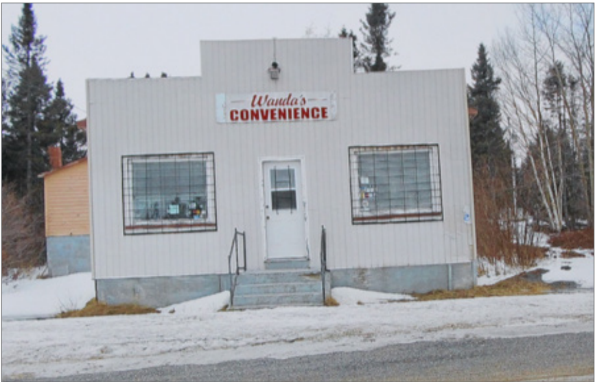
Wanda's Convenience.