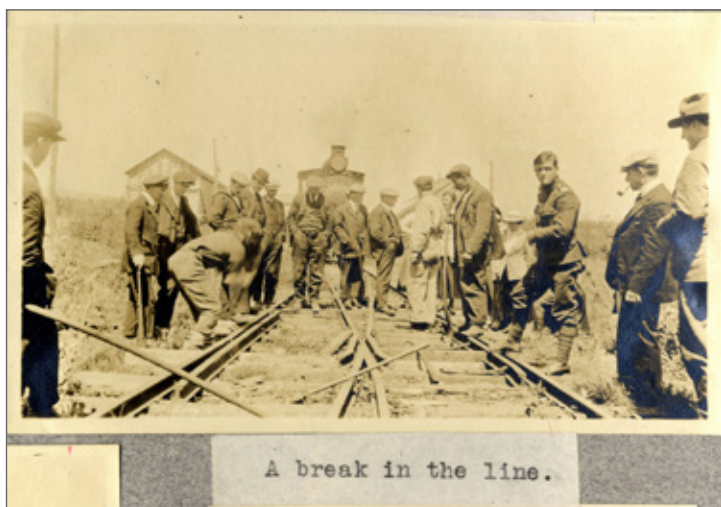
PF-329.042. A break in the line. 1917.