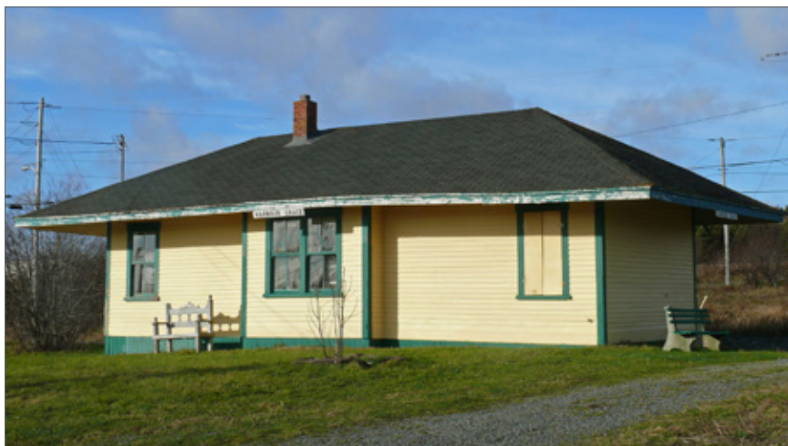
Harbour Grace Railway Station Registered Heritage Structure.