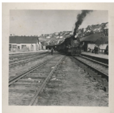
VA 15a-31.11. Train arriving at railway station, Corner Brook [194-?].

the cars in, and go up to the Lundrigan's if they'd had freight come in in boxcars and different things like that. You'd be busy, busy for the full eight hours. The only slack shift would be twelve to eight. ... Apart from that sometimes you'll go down to Curling, to the isle plants, and then you'd have Canada Packers, they'd have carloads of freight come in, you'd have to take the empty cars out and put the loaded ones in, different things like that. ... eight to four shift was really busy, four to twelve was fairly busy, twelve to eight was a little bit on the easy side. And I worked that twelve to eight shift for three years straight."