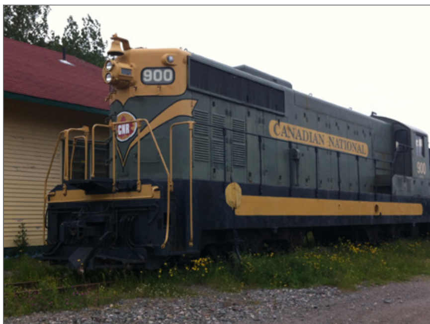
CNR Locomotive 900, Clarendville.