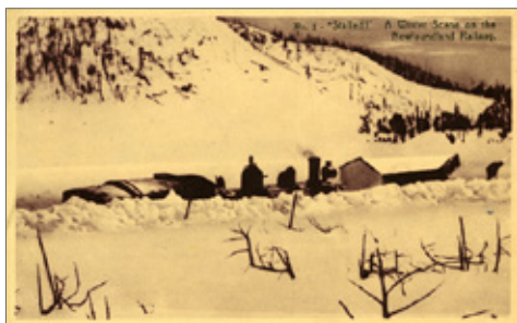
A 19-61. Stalled! Winter scene on the Newfoundland Railway [191-?]. Originally published by Ayre & Sons (St. John's, N.L.).