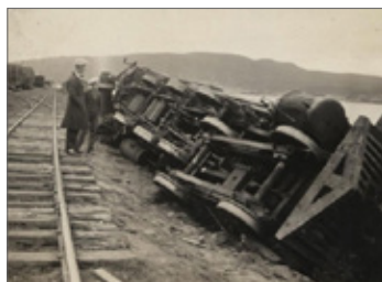
A derailment on the Bonavista Branch Line. The roadbed had grown soft, sending the cars into an uncontrolled rocking motion which tipped them over.