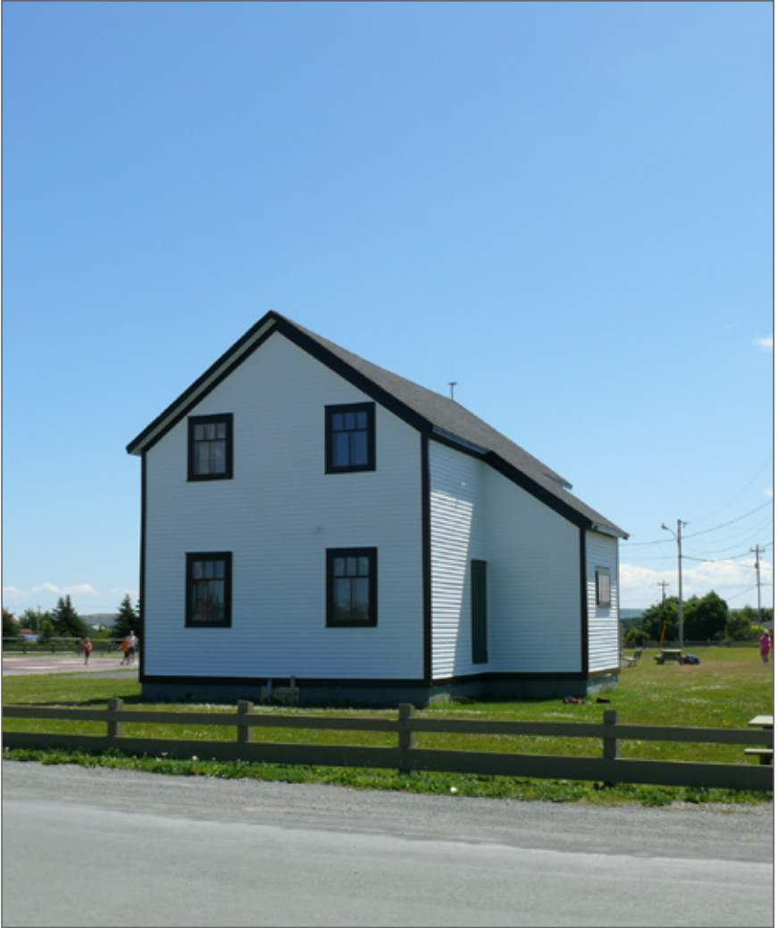
Bay Roberts Railway Station Registered Heritage Structure.