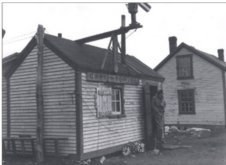
20-05-001. Gaff Topsail House and Railway sign c. 1950.

them coming for miles, the trains, in the summertime with a load of cars behind them, you know. Have her opened right out trying to get up the hill eh. By the time she'd get to the summit, to get over it, she's just barely moving. Lots of times we'd be there, work crews all off the track waiting for the train to come, eh. You'd hear her roaring down at the bottom of the Gaff somewhere or another, pulling a load, eh. Especially weekends when we'd be coming home, all hands out to the station waiting for her to get there. Hear her coming for miles, nothing but a roar."