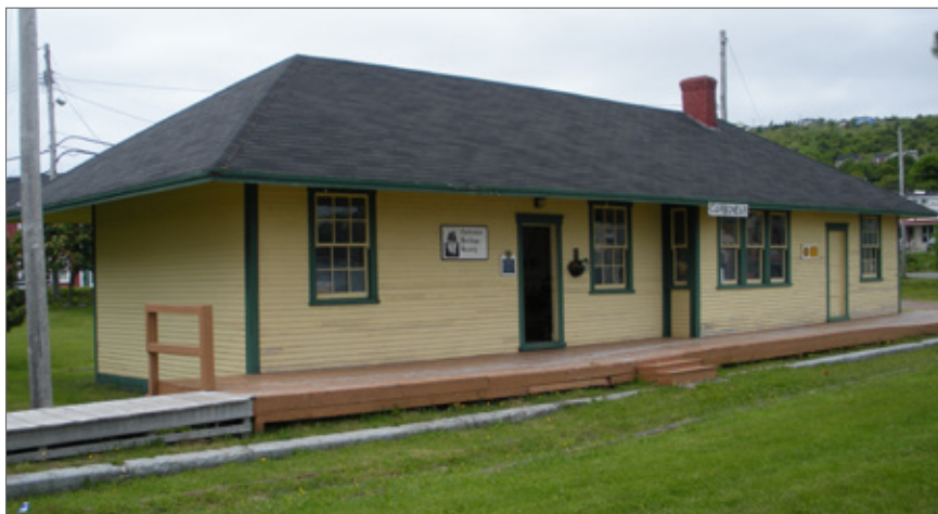
C.N. Railway Station Registered Heritage Structure, Carbonear, N.L.