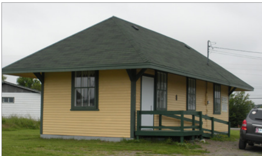
Western Bay Railway Station Registered Heritage Structure.

The stories in this small collection are taken from those interviews on the DAI, and barely scratch the surface of the tales which could be told about the history of the railway in the province.