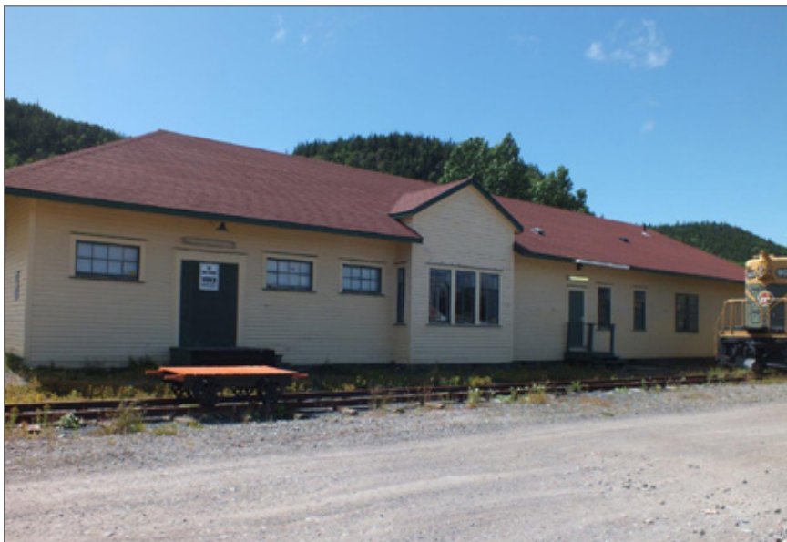
Clarendville Railway Station Registered Heritage Structure.

“Well, I came to work 7 o’clock and I was in charge until 7 o’clock in the morning. ... You were servicing your trains. Take the 12 o’clock shift, you service an average of a locomotive an hour. Four o’clock to 12 wasn’t as busy, and day shift was practically nothing. ... All the rods [on the locomotive] has grease nipples on them. So you had to grease them, and there’s a sand dome ... you would have to put sand up in that dome, and clean the fire. My job wouldn’t be to actually clean the fire, but I had to rake it down into pan, and when the pan got full, you moved her ahead and turned some water on it to kill the fire. My job was making sure that the ashes got down.”