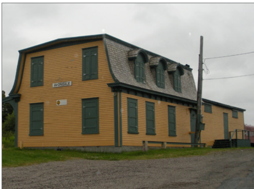
Avondale Railway Station Registered Heritage Structure.

“And another time, we’re up in Kitty’s Brook. And we were waiting for the snow plow to come up over the Gaff. Was on this passenger train, number 2. And we’re waiting for the plow once, but the overcome when we stopped. This American soldier came up. So